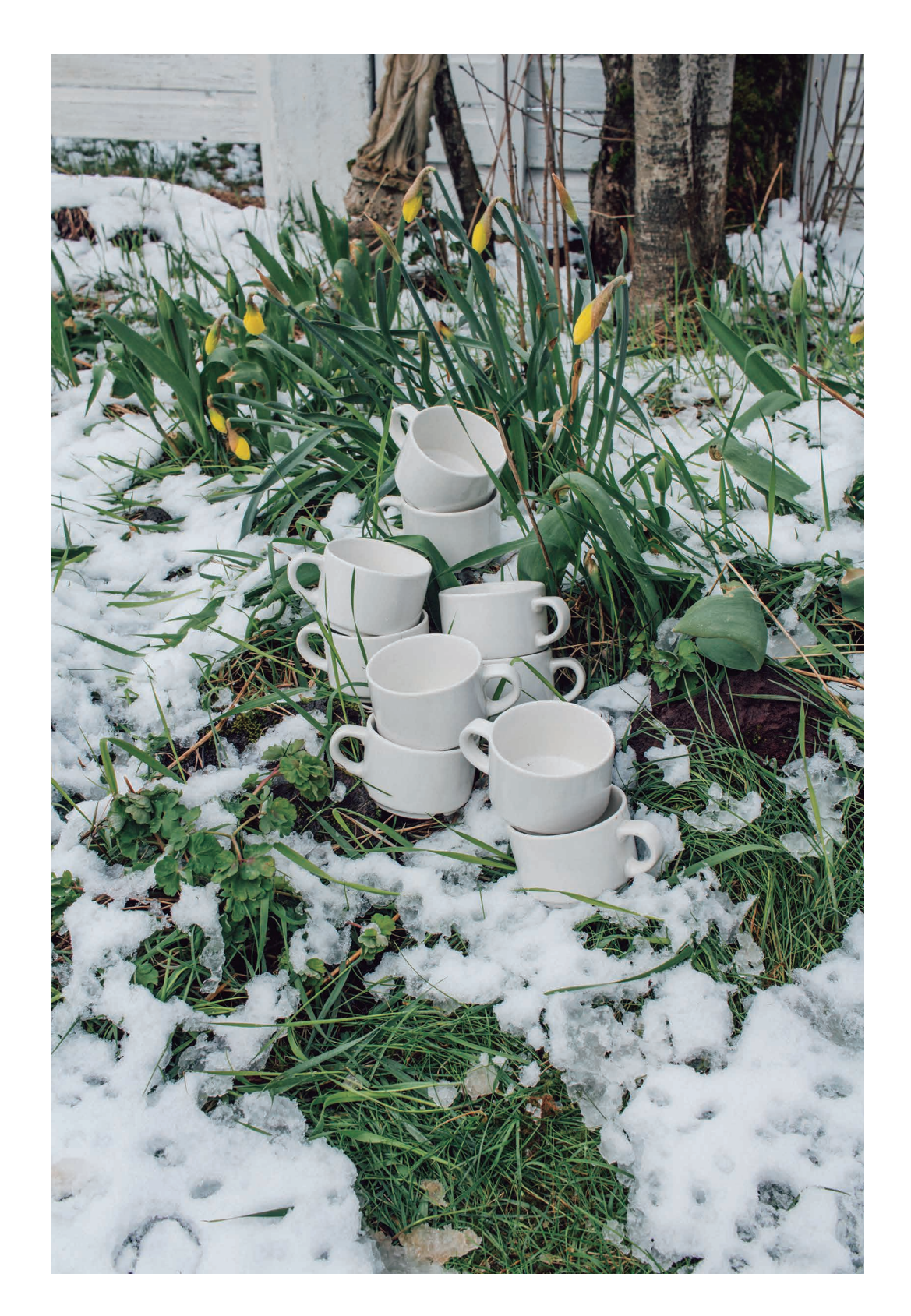
our collaborators had while making our ten issues of SOLO?